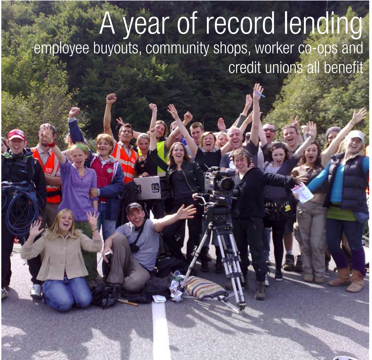
The cast and crew of 'Enough Rope' filmed in France by First Take (see page 4)

A year of record lending employee buyouts, community shops, worker co-ops and credit unions all benefit